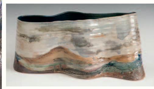
Saltglaze Waveform from Terrain Series